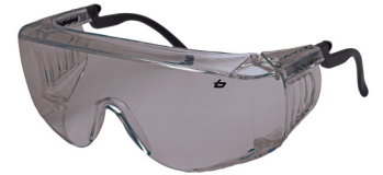
1650516 • Smoke wrap around frame