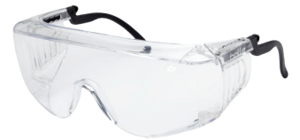
1650515 • Clear wrap around frame