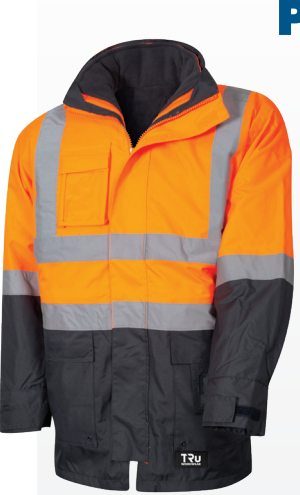
AVAILABLE IN ORANGE / NAVY