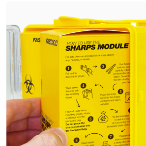
Clear, illustrated instructions for safe waste collection and disposal