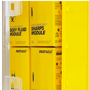
Two sealed sharps modules and two sealed body fluid modules