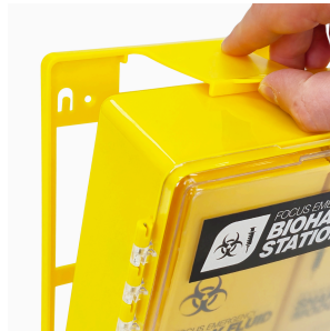
Dual purpose wall mountable and portable plastic case